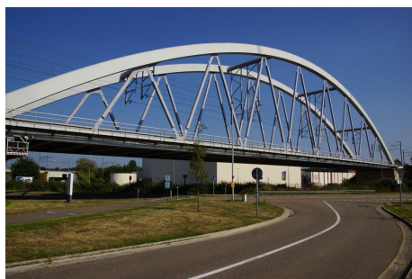
Figure 1. The KW51 Bridge.